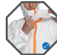
Self-adhesive chin flap