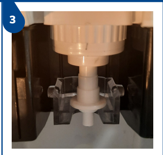
Ensure that the ridge on the pump is located on the uppermost ledge, as illustrated above.