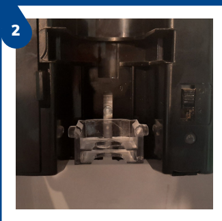
When putting the reservoir back, please ensure the clear component (above) is pushed down to the bottom of the tracking.

After opening the front by pushing the white button underneath, squeeze the white clips and the reservoir will lift straight out.