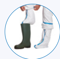
Also available with socks